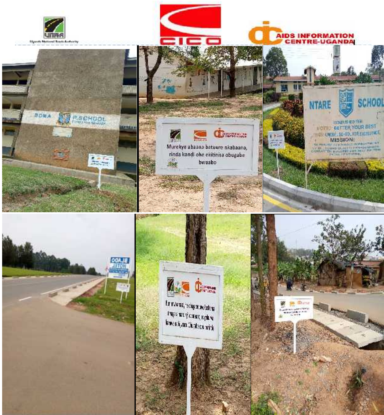
Pictures of Talking Compounds taken from Booma PS, St Elizabeth Girls SSS, Ntare School, Golf Corse road, All Saints link and Mubangizi road

A total of 12 monthly Integrated Dialogue sessions /Meetings on HIV & AIDS, GBV and VAC for 350 Road Constructors and Community members were conducted and this promoted positive relations between contractor workforce and the local communities.